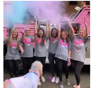
Kappa Rho at their 2019 color run.

Color runs are tons of fun, and your participation on October 23rd will support Kappa Rho and the ZTA Foundation! Pro tip: no one has more fun at color runs than kids, so bring the whole family! The fun starts at 10am. Look for registration information coming soon to our Instagram account.